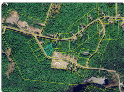
Notice 25111705: Residential lot (Lot 400) along Pine Cres.

The official notice for these land requests can be found on the Dokis First Nation Official Facebook page and on the Dokis Band Members Portal at: https://dokis.ca/members/ .