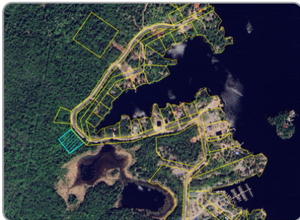
Notice 25111701: Residential lot along Charlie's Bay Road.

The notice date for the following land requests was issued on November 17, 2025. The 30-day review period will end on December 17, 2025.