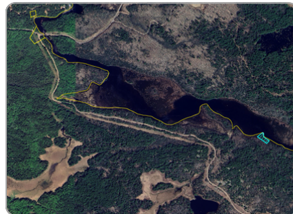
Notice 25111704: Seasonal waterfront lot along Restoule River.