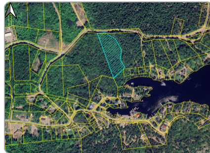
Notice 25111702: Extension to a residential lot along Charlie's Bay Road.