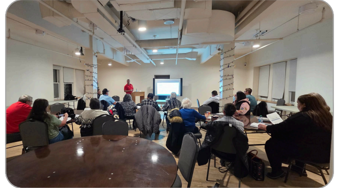
North Bay Session – January 7, 2026

If you haven't attended a session yet, please join the final session in Dokis on Tuesday, February 10 th at 6:00 p.m.