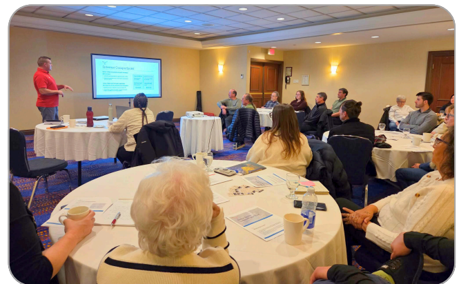
Ottawa Session – January 27, 2026

Join the final session on February 10 th online or at the complex. Zoom link below: