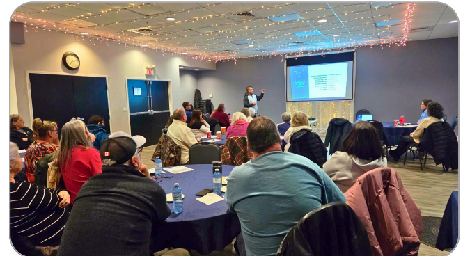
Sturgeon Session – January 15, 2026